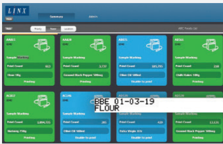
At a glance printer status