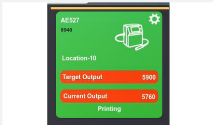
Set KPIs and measure progress against targets